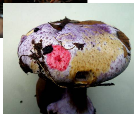
Cortinarius sodagnitus showing the violet colours on cap and stem, also the typical dark 'droplets' on the cap and the cherry red staining with KOH. Note also the cortina (weblike fine mesh) on the upturned smaller fruitbody which protects the immature gills when young.

My thanks to all attendees. We found an amazing range of interesting species, proving once again what a special place this is. We recorded 57 species, of which 11 were new to the site and as already mentioned some new to the county too. My thanks also to Claudi for his excellent photos.