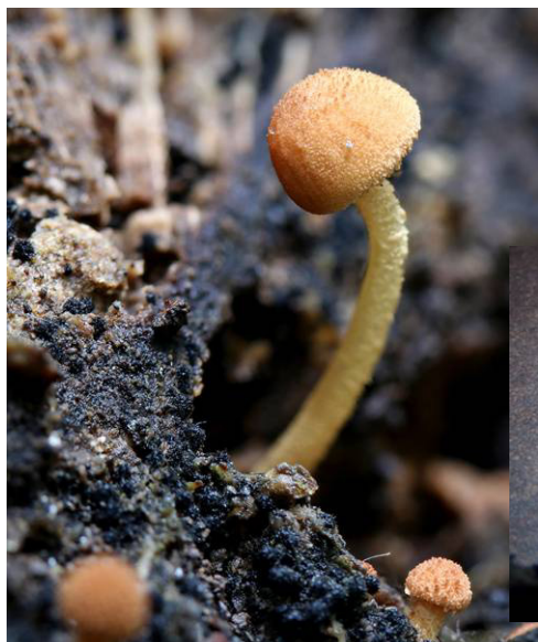
Flammulaster muricatus found growing out of the end of a Beech stick, also its gill edge cystidia and spores and unusual globose cells on the cap surface which give this species its powdery look.