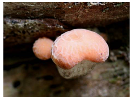
Rhodotus palmatus found on Wych Elm today (CS)

A species we've found here several times previously on the same fallen Wych Elm trunk was obligingly fruiting again for us today; Rhodotus palmatus (Wrinkled peach) has decreased considerably since the devastation of the Elm population in the UK.