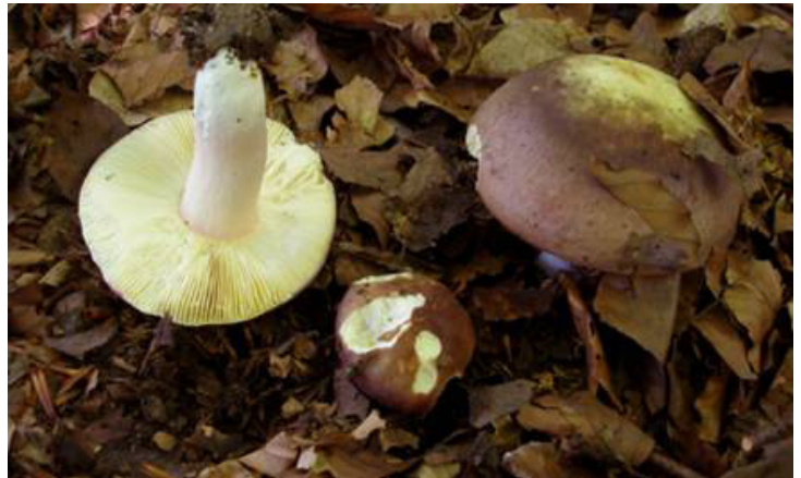
Russula olivacea showing typical variation in cap colour (PC)

In previous visits here we've focused on just one section of the wood, but this time Alan had asked permission for us to take a look at a different section as well – one which belongs to the original owner's daughter – and this proved interesting and rewarding. Early on we came across several fruitbodies of Russula olivacea (Olive brittlegill) showing its characteristic pink flush at the top of the stem. I include here a photo taken at this site in 2010 which hardly does it justice but the flush is just visible.