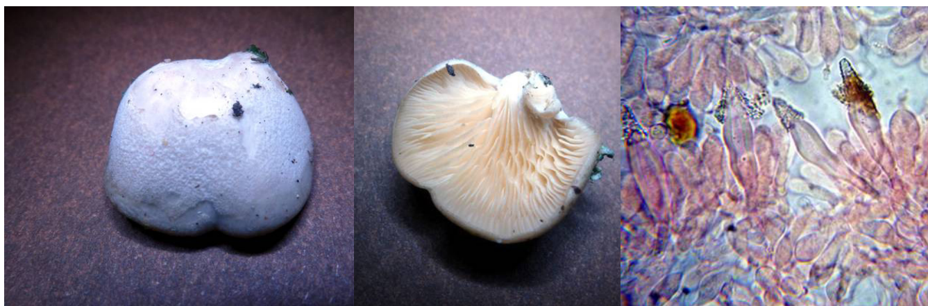
Hohenbuehelia mastrucata with a view of the thick-walled metuloids found on the gill edge x 1000 (PC)

I've left the three most interesting finds till last. The first was found by Alan and was growing on a fallen Beech trunk, a single small white Crepidotus type which I immediately thought was something I didn't know. It seemed odd for a Crepidotus to be growing singly and on something as big as a trunk, furthermore the gill colour was not like the Crepidotus photo above but paler with a cream pink tinge and the general jizz was just not right for that genus. At home I set it up to drop spores and left it till the morning when, sure enough, the sporeprint was not the clay to snuff brown of Crepidotus but white. I had wondered about the genus Hohenbuehelia (not one I had any experience of) and checked in the literature to see if there were any special features which might confirm this. There were, and looking at the edge of a gill from Alan's specimen under the scope I found thick-walled cells (cystidia) with pointed tips covered in small crystals – bingo! I eventually tracked it down to Hohenbuehelia mastrucata (Woolly oyster), a rare species with only 36 UK records and down as endangered on the Red Data List (RDA). It is new to the county though has been found quite nearby in Oxfordshire. Apologies for the quality of the macro photos but by the time I realised what we had the material was not at its best.