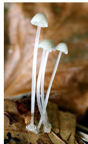
Left Hemimycena lactea (PC) and right Mycena stylobates (CS)

We found a log liberally covered in a colony of a species of Crepidotus (Oysterling). This genus is characterised by little shell-like gilled caps, almost always white, which lack a stem and are found on a variety of plant substrates: twigs, sticks and herbaceous stems. Nearly all need a scope to confirm identification and our collection today was no exception. It was Crepidotus lundellii (no common name and one which we've not recorded here since our very first visit.)